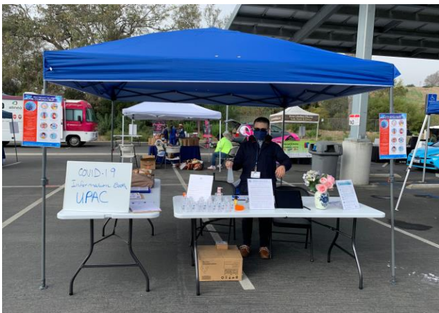
UPAC Information Booth Union of Pan Asian Communities (UPAC) hosted a COVID-19 information booth, providing educational materials, sanitation handouts, and COVID-19 safety reminders.