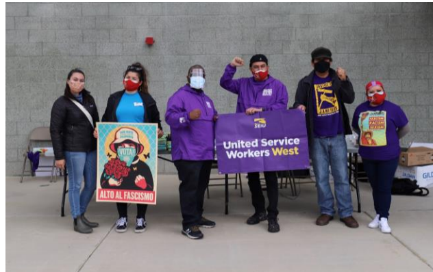
Project SAVE Group Vaccination Partnership with SEIU Janitorial at Imperial Beach- Mar Vista High School. 191 SEIU employees received their COVID-19 vaccine!