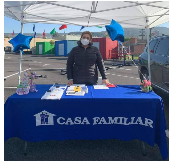
Casa Familiar Outreach at the San Ysidro Health Swap Meet.